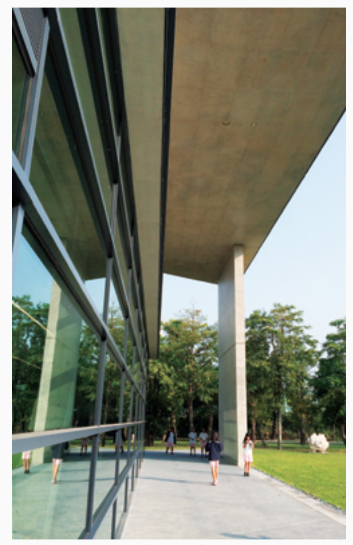
Blending outdoor spaces with the environment.

When you walk onto Asia University's campus, you will be drawn to the varied shapes and special angles of the Asia Museum of Modern Art. Ando is an expert at utilizing geometric shapes in his architectural designs to arouse emotions. Visitors are often amazed at how this architect was able to rise to the challenge of using circles and triangles to successfully design an attractive project. There is also the question about why he opted for the difficult design task