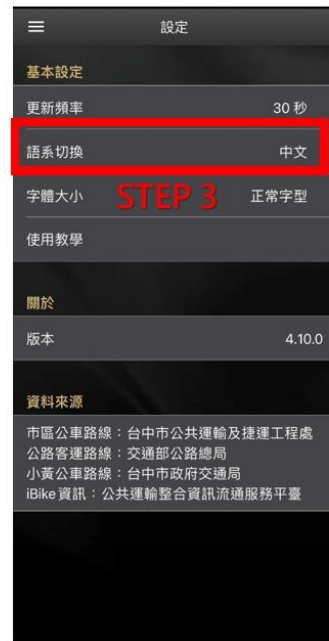
STEP 3 Language