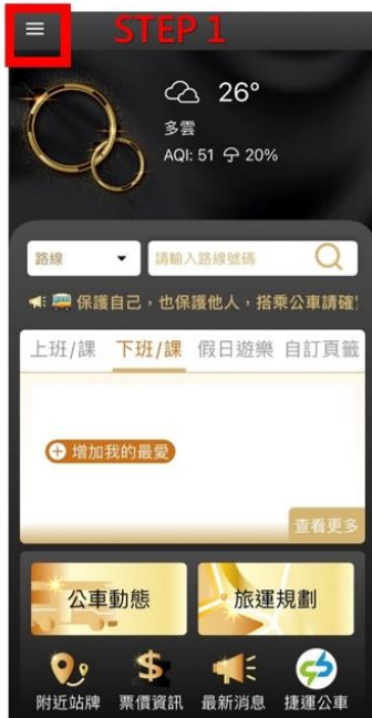
STEP 1 Click List