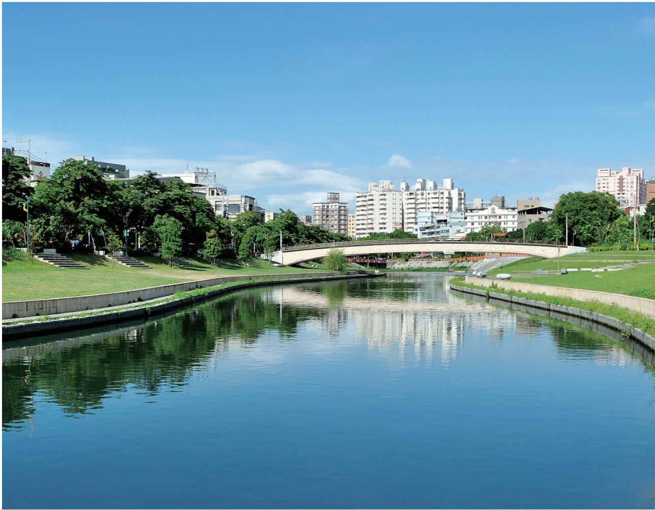
Cambridge Riverbank Park (Old Dali Han River) is now a popular tourist spot.