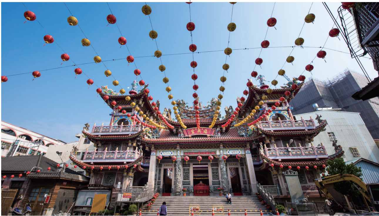
During the Qing Dynasty's Qianlong period, the main religion in Fujian Province was Fuxing Mazu.

and houses. The bamboo groves here were thick enough to prevent intruders but attracted nesting birds, thereby giving this place its name of "Niaochuwei" ("birds nesting in a wall of bamboo"). Even now, birds visit the fish-filled river to enjoy an abundant meal. Resident riverside farms here also have attracted butterflies and other insects, providing beautiful eco-friendly scenes for visitors.