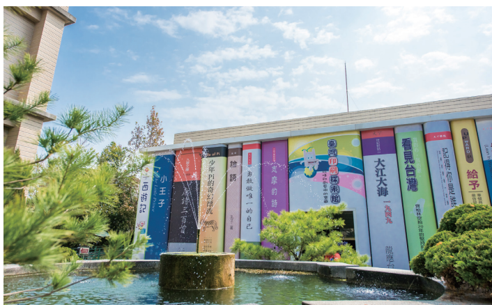
1. Tailikhit Community Center, built in 1929, is a place to learn about Dali's culture and history. 2. Taiwan Printing Discovery Center is the first printing factory open to visiting tourists.