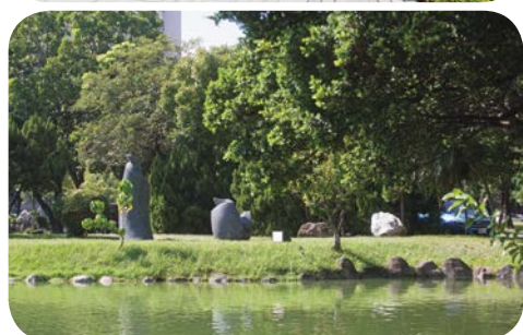
↑ National Chung Hsing University has a peaceful academic environment.

↓ National Chung Hsing University's lake is among filming locations for "Campus Confidential".