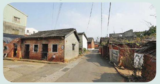
↑ Most of the top Golden Bell Awards were won by "A Boy Named Flora A", filmed in Dadu District's Ruijing Village.

Taichung City Government's recent film development promotions have meant that many movies and TV dramas have been filmed in the city, offering viewers a variety of Taichung perspectives.